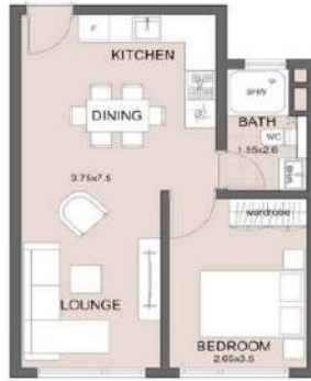
Standard One Bedroom