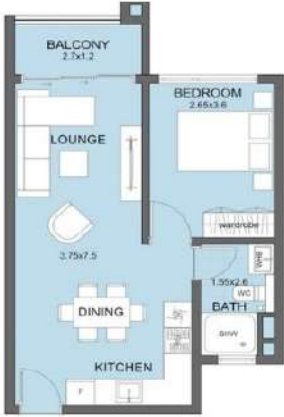
Standard One Bedroom