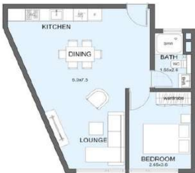
King One Bedroom